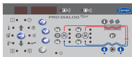
Pro-Dialog Plus operator interface